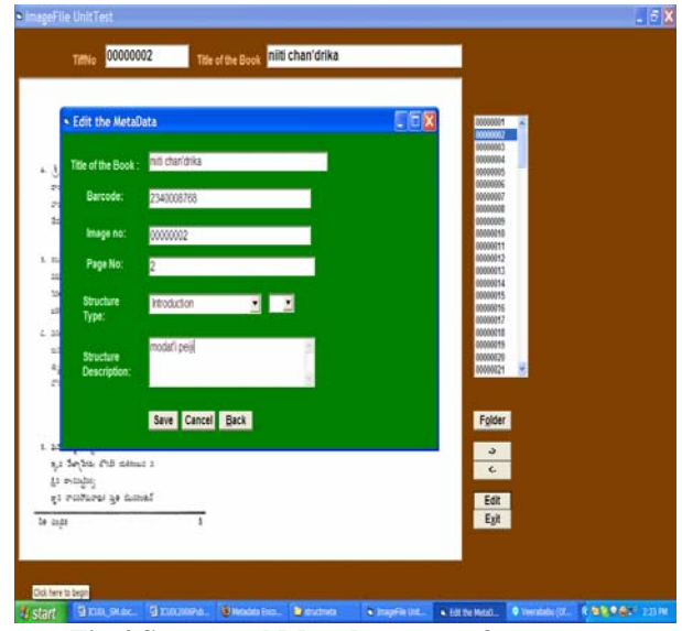
Fig 4 Structural Metadata entry form